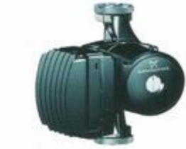
(Grundfos of Denmark)